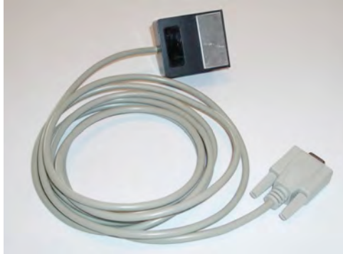
Figure 1 H-4140.12 Infrared Interface To Serial Port Cable