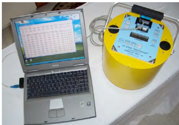
Figure 3 GeoGauge Connected To A PC