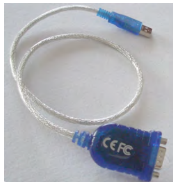
Figure 2 Typical Serial To USB Adapter